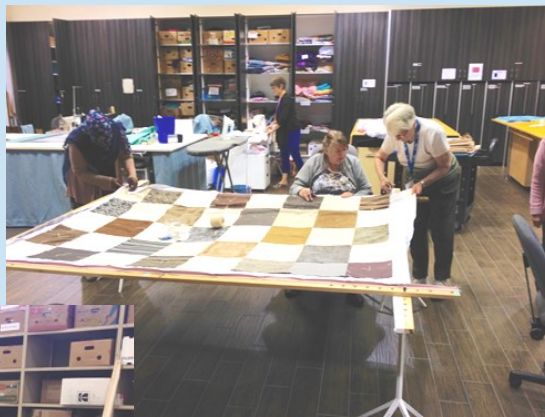
Bundled blankets ready to be sent to fill a need!