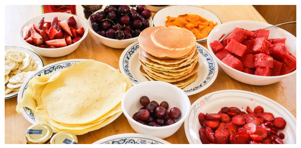
Pancakes are optional, but if you'd like to eat some during our hangout time, you are more than welcome!

This year, we can't gather in our church building for Shrove Tuesday. But will that stop us from sharing a meal together?? Not us!! We invite you to join us for an at home gathering.