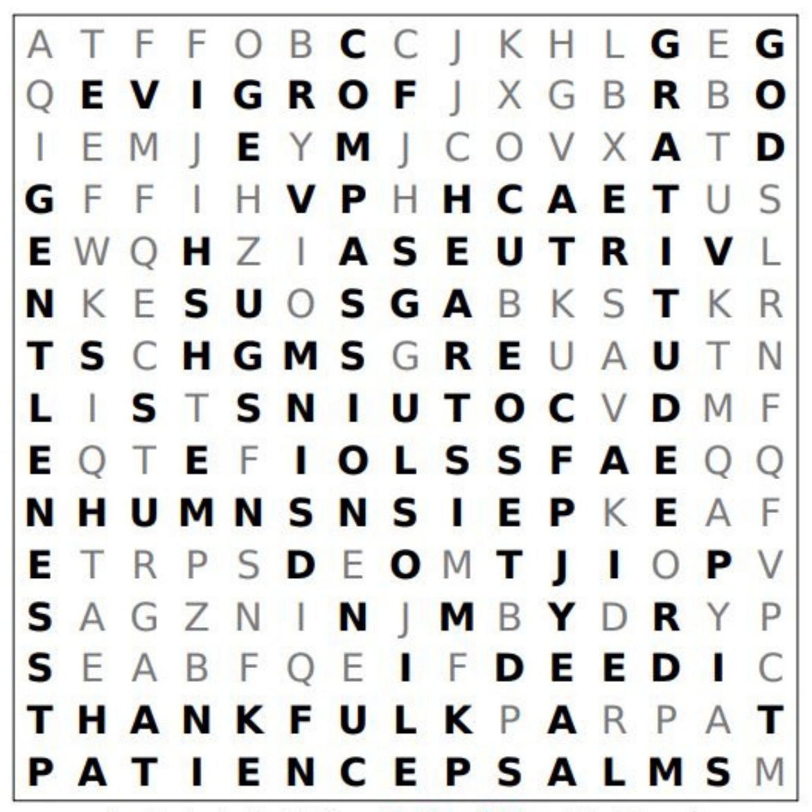
Created using the Words Up Games Word Search Maker at WordsUp.co.uk