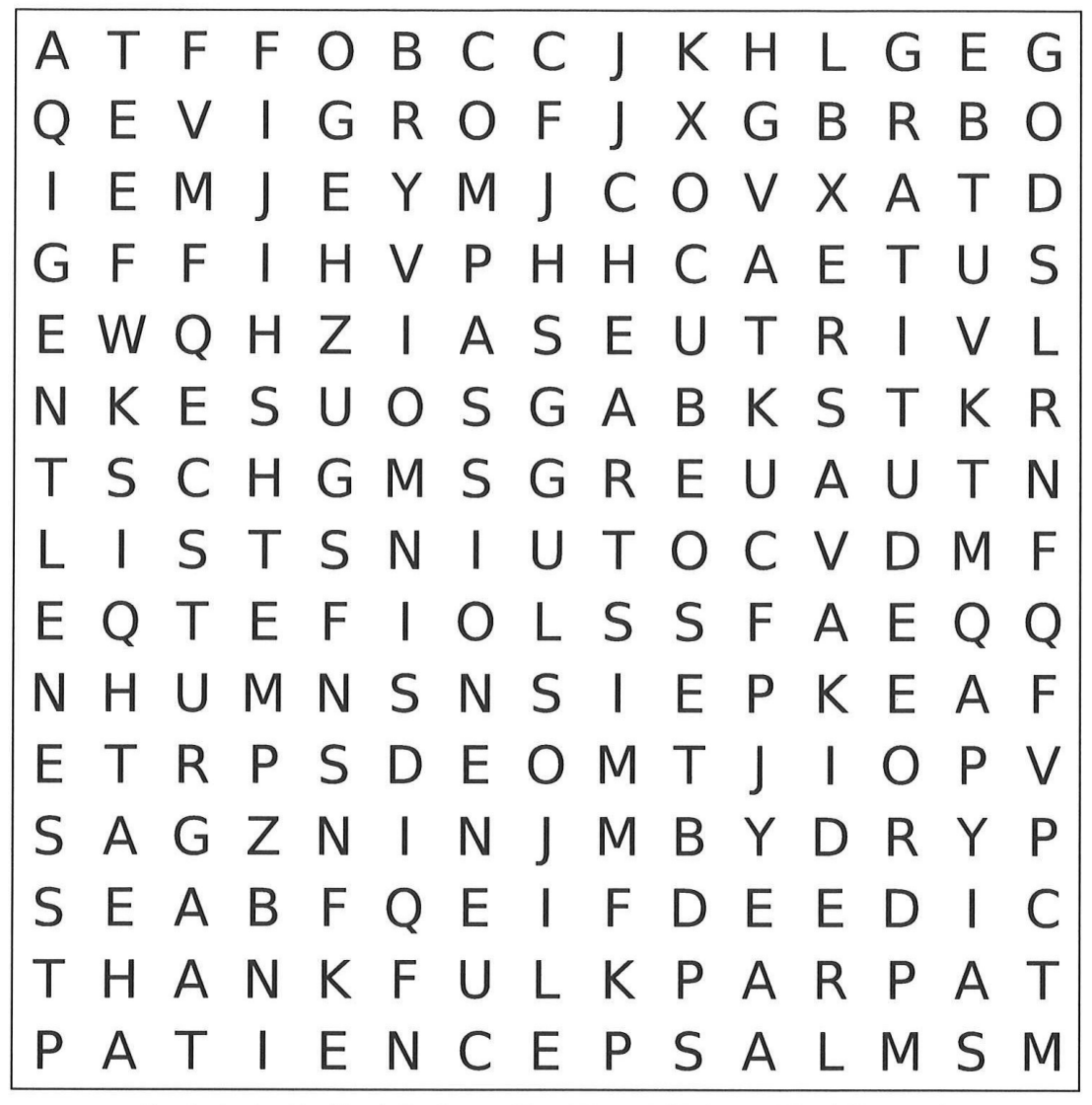
Created using the Words Up Games Word Search Maker at WordsUp.co.uk

ADMONISH COMPASSION DEED FORGAVE FORGIVE GENTLENESS GOD