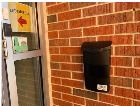
During the week

We have two places you can give your donation envelopes. During the week, you can use the black mailbox located near the glass doors on the Virgil side of the building. It is strongly recommended to only leave cheques in this location. On Sunday mornings, there is a donation box by the welcome centre. Both of these are emptied daily.